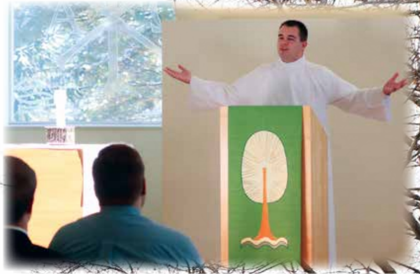
Part of a student's education includes learning how to lead worship.