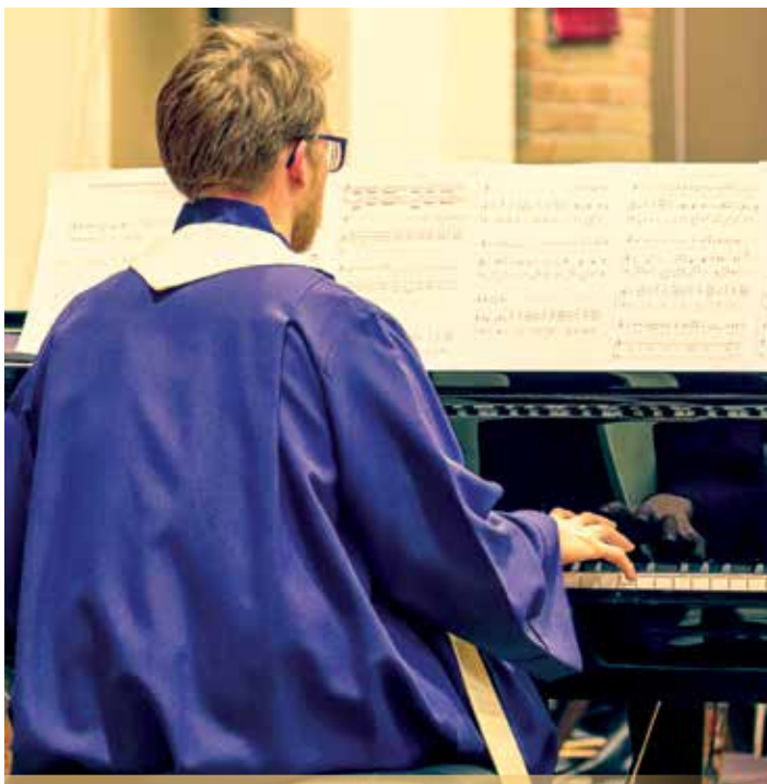
Gifts to the seminary are used in many ways. In this case, funds were directed to purchase a new grand piano for the auditorium.