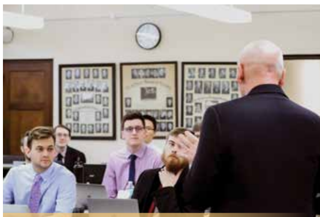
Strategic planning also includes studying how the classroom space can best serve today's students.