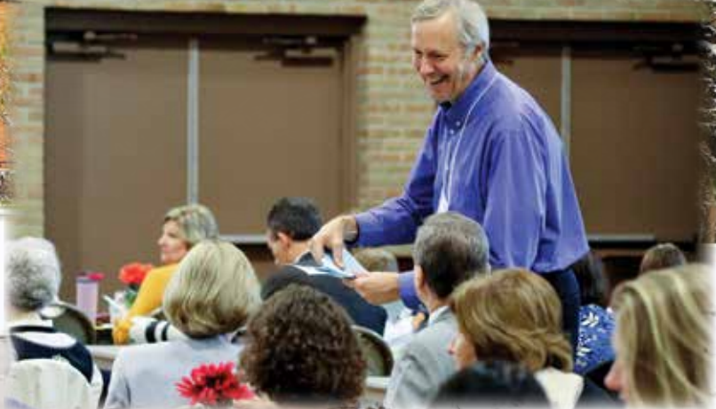
At Friends of the Seminary Day in early October, participants learned more about the seminary's mission.