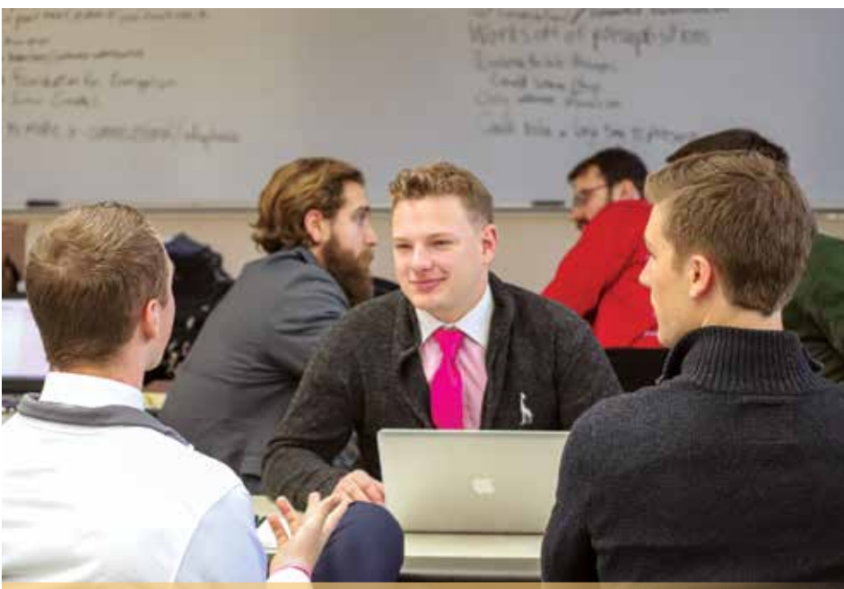
Whether learning in the classroom, in early field experience, vicar year in congregations, or online during a pandemic, students stay focused on their goal of preaching the gospel.

Since the Lord chooses to give the blessing of 20/20 spiritual vision through his Word, as it is read, heard, and pondered, life at the seminary centers around the living Word of Christ. In his final letter, the Apostle Paul directed Timothy to prepare future gospel servants who would be able to carry on the work after he had finished the race: "And the things you have heard me say in the presence of many witnesses entrust to reliable men who will also be qualified to