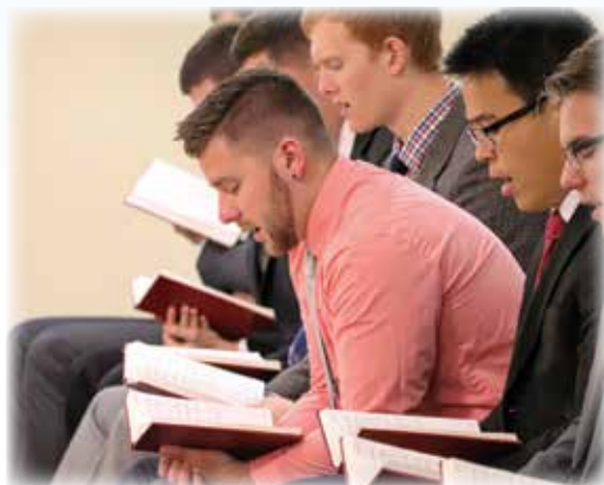
One of the highlights of each school day is the opportunity to worship in chapel.