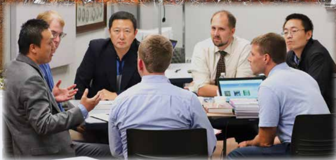
Asian ministry partners gather to plan for their work and outreach.