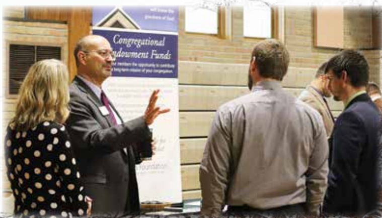
Each year at Mission & Ministry, seminary students hear from WELS administrators in home and world missions and learn what synodical resources are available to support their future ministries.