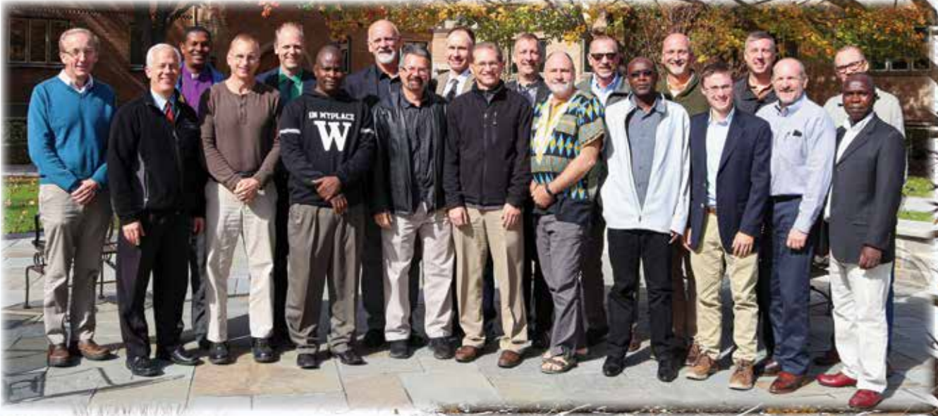
Eighteen participants working on five continents attended a Dialogue Education Conference hosted by the Pastoral Studies Institute.